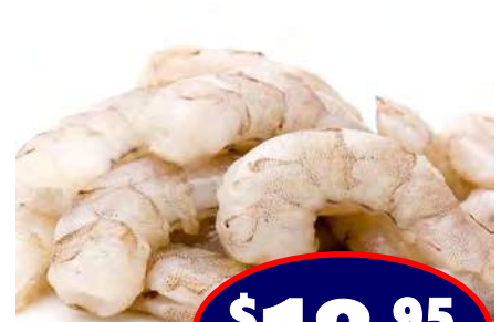
Prawn Meat 1kg 31/40