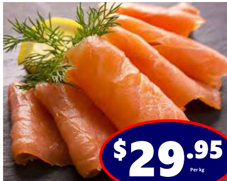
Sliced Smoked Salmon