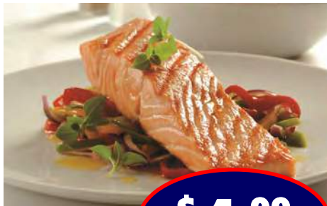
Pacific West Salmon Portions 200g