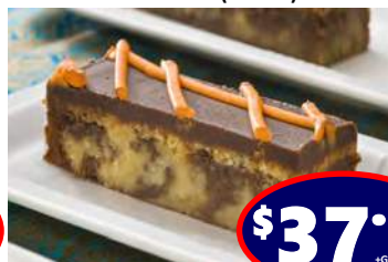
Jaffa Slice (18 Cut)