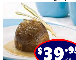
Stick Date Pudding (16)