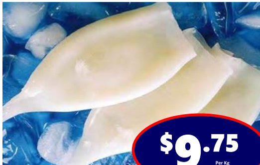
U10 Squid Tubes (5kg)