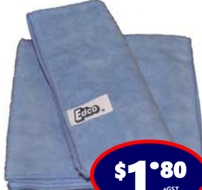
Large Microfibre Cloths (3pk)