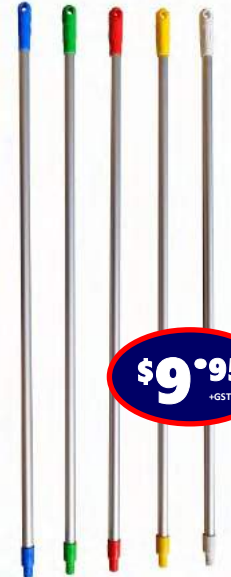
Enduro Handle 1.35m x 25mm