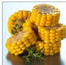
Rustic Cut Potatoes 2kg