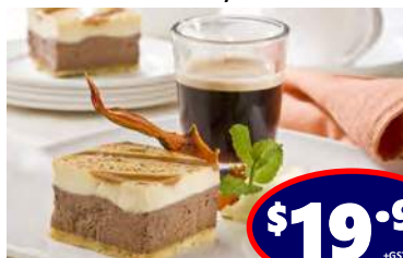
Choc Vanilla C/Cake Slice