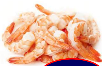
Cooked & Peeled Cutlets 26/30