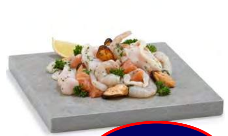
Marinara Mix 1kg