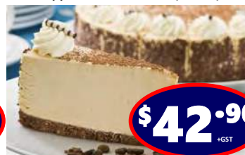
Cappuccino Cheesecake (16 Cut)