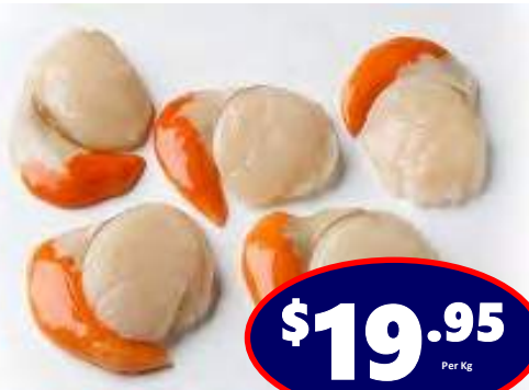
Scallops Peru Roe On 20/30 1kg