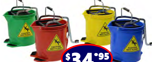
15lt Metal Wringer Buckets—Colour Coded