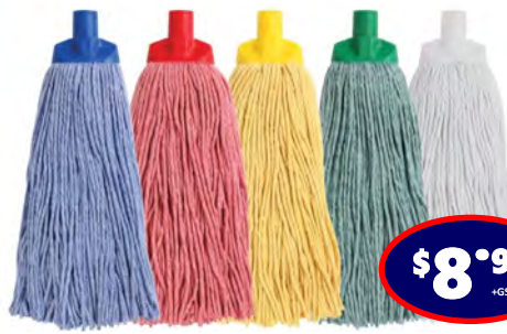
Enduro Mops—Colour Coded