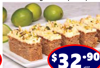
Hummingbird Slice (18 Cut)