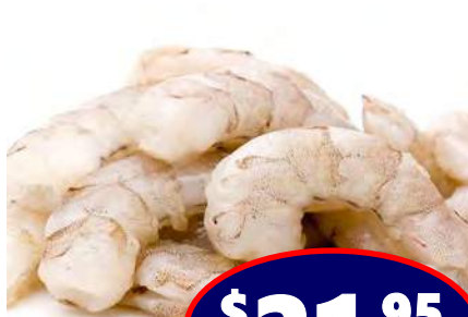
Prawn Meat 1kg 26/30