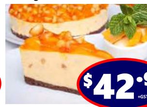
Mango Macadamia Cheesecake