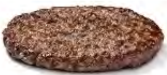
Tip Top English Muffins