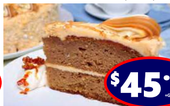
Banana Caramel Gateaux (16 Cut)